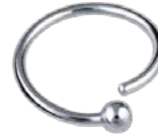
FIXED BEAD RING