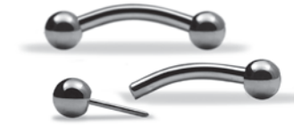
THREADLESS CURVED BARBELL